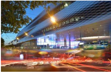
Modern infrastructure by architects Herzog & de Meuron