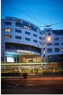
Congress Center Basel from the outside

Images to download at www.congress.ch/images